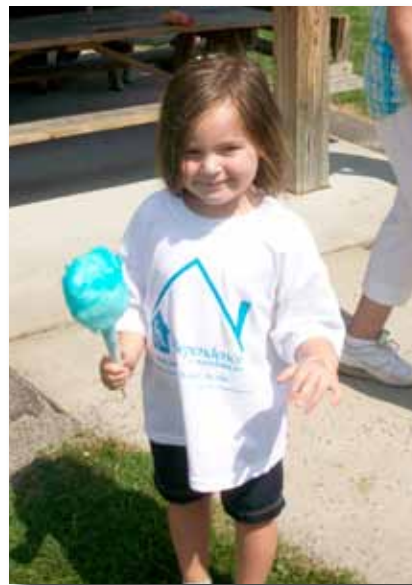
294 walkers, 22 wheelchairs, 1 wagon, 3 bikes, 6 dogs! And in just over an hour that it takes to participate, more than $36,000 was raised for our programs!