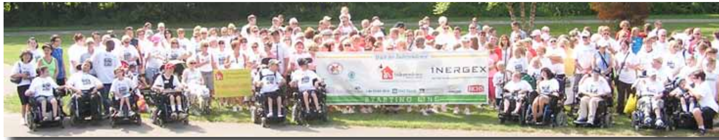
Thank you to all who participated in this year's Walk for Independence! The event was held at the beautiful Elma Village Green. A perfect day – God smiles on us again!